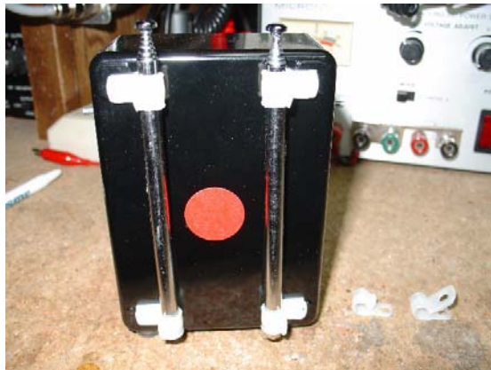
Back with Whips attached