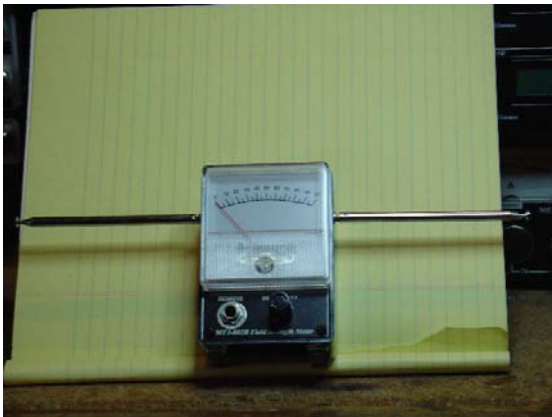
Front with Whips

This simple modification to the MFJ-802B really solves all my issues with this FSM. Not bad for less than $1 in parts!