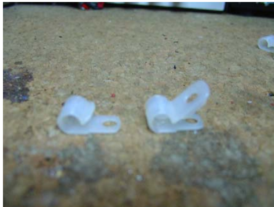
Nylon 1/4" Clips – Modified & Unmodified