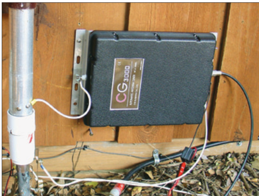
Figure 2 — Each auto tuner was tested at the base of the author’s 43 foot vertical antenna.